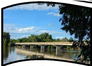
THE RED CEDAR RIVER VIEWED AT CELEBRATION PARK